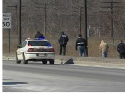
A photo from the web of a squad car parked while police are looking for evidence related to the death of a 14 year old.