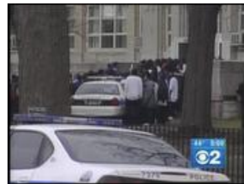
A photo provided on the website of CBS